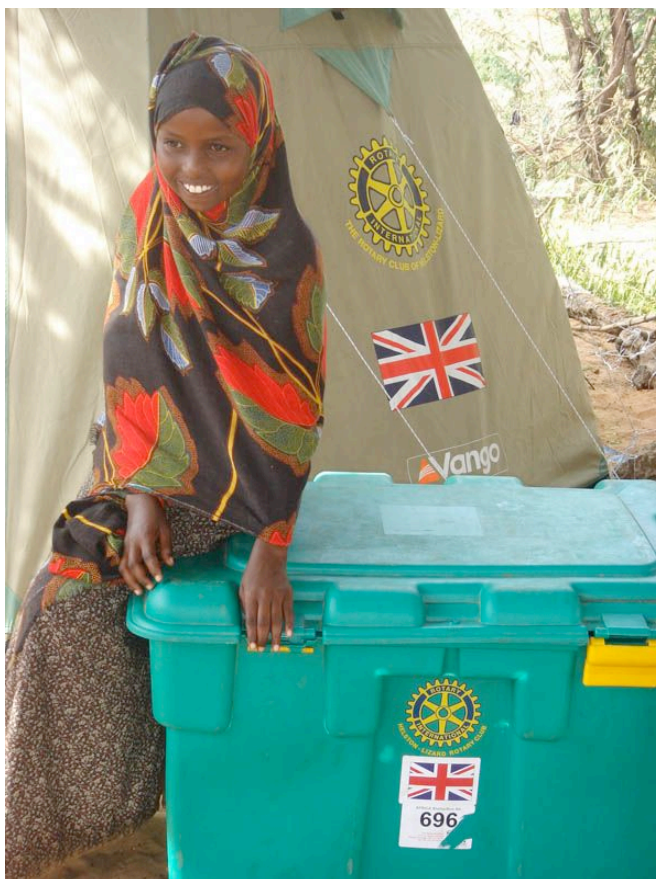
Somali girl in camp provided with ShelterBox tents

Providing the 100,000 tents and other equipment necessary to house one million people will cost £50 million. It's an ambitious challenge and so far ShelterBox is only just starting to tackle the problem in Africa but making A Million In Africa happen is possible.