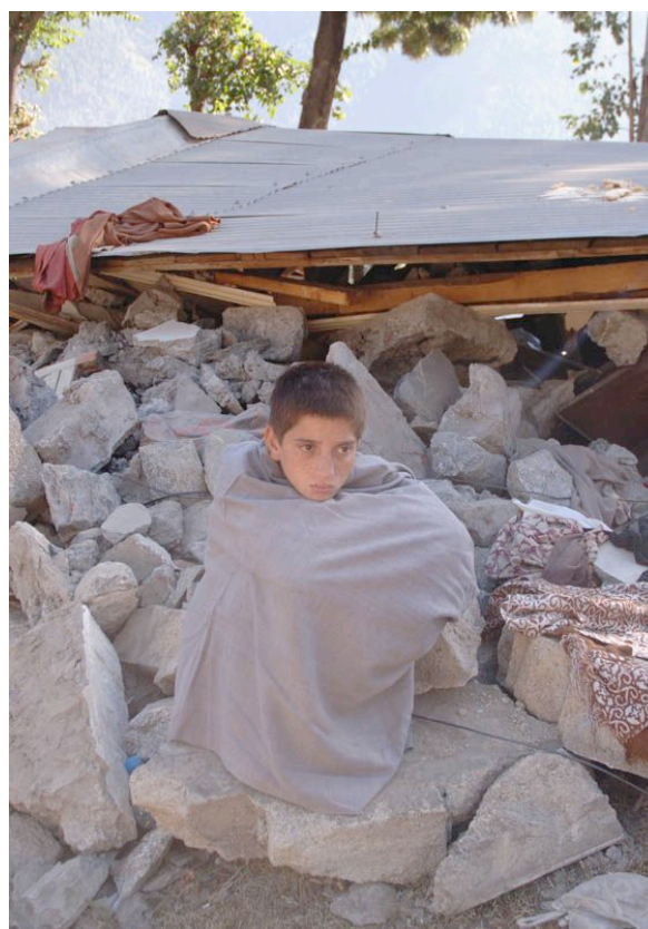
Young earthquake victim in Pakistan

Every ShelterBox is also individually numbered and donors can track where they are sent via our website www.shelterbox.org