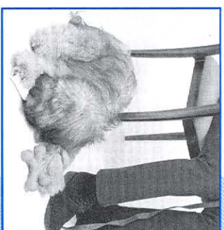
When he is out of his kennel, keep your puppy on a leash next to you and he will learn to lie calmly and play with his toys.

All three of these training aids, short-term confinement, long-term confinement and supervision, are used in an effort to create a dog that can eventually be trusted to spend time in your home when you aren't there. As a general rule, most dogs should not be allowed to roam unsupervised in even just one room until they are at least 9 months old. However, some dogs can handle such freedom sooner, and some dogs can't until they are well over a year old.