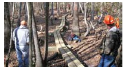
Bridge building near Gar Pond. December 13 work hike