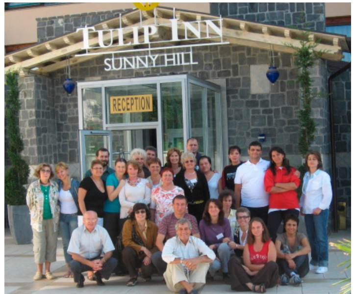
EXCURSION workshop participants