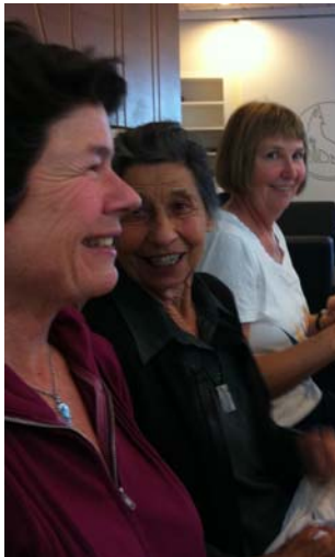
(December Lunch Bunch)

Due to slips in the Waitakeres the train ride had to be cancelled. We hope to reschedule once they are back in operation. To replace that event we will once again take advantage of our beautiful summer and walk out at Piha Beach however, taking a different route North. Meet at the end of Marine Pde/North Piha rd. This walk requires reasonable fitness since it will have steady up hill sections. Please bring water and snacks. Friends are always welcome. For carpooling meet at Byzantium lunch no later than 12.30.