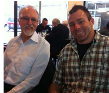
(December Lunch Bunch)

Point Chevalier (09-846 6565) Hope to see you there. Also remember if you have a restaurant you would like lunch bunch to try, please send suggestions to Dawn Elvidge or auckland@unitarian.org.nz!