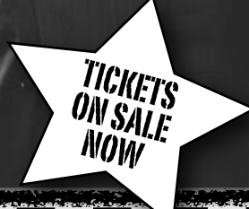
TABLE FOR 10 $900.00 EACH