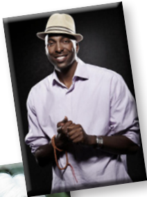
NBA Star John Salley