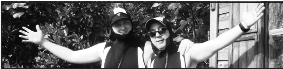
Trivia answers: 1. Dawn and dusk. 2. Coachman. 3. Hydrophobia.