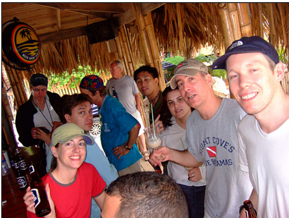
Divers wind down at Sundowners in Roatan's West End after a fun day of diving.

August 1-16, 2009 A true “final frontier” of diving on an ultra-luxury liveaboard.