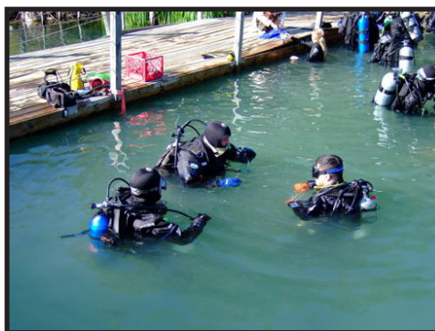
Divers practice skills in a quarry

of the hotel still slumbers, ignorant of the wonder we are off to enjoy. We trade smiles and groans and comment about how it's way too early, but in the end, any one of us would suffer waking up at any hour to go diving. Sometimes you share only a single boat ride with those folks, sometimes