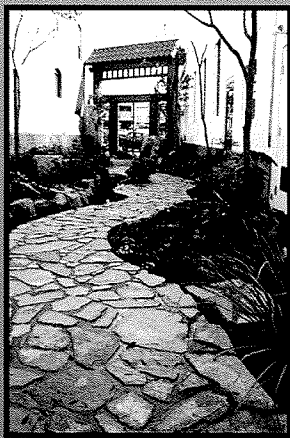
A view of the stone path in the Asian Garden that leads to Dr. Sun Yat-sen Memorial Gate.