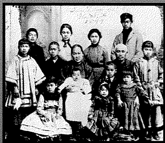
Portrait of San Diego's most prominent early Chinese settlers: Ah Quin and family, 1900.