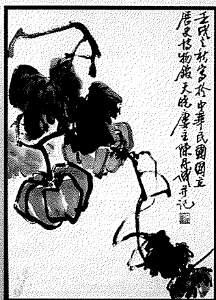
Powerful brushstroke painting by Chinese Master Dan-Cheng Cheng for the National Chinese Historical Museum in Taipei, Taiwan, ROC.