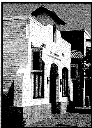
Front View of the San Diego Chinese Historical Museum on 3rd Ave.