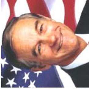
Ron Paul of Texas

Huckabee left his state's GOP in shambles, demoralized and suffering from many electoral losses. Lately, he's been preaching very different sermons than what he practiced as Governor. He's also become friends with McCain.