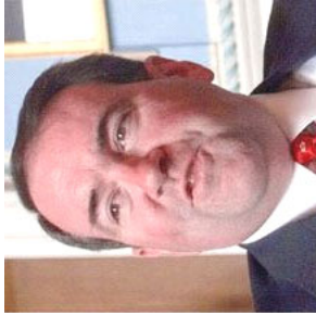
Mike Huckabee of Arkansas

Often called a "maverick" by journalists, McCain has repeatedly co-sponsored liberal bills with his Democratic peers. He opposed Bush's tax cuts, considered "originalist" judge Samuel Alito too conservative, and has led efforts to undermine gun rights, to grant amnesty to illegal aliens, to further regulate health care, to increase central economic planning in energy production, and to control emissions of supposed "greenhouse" gasses.