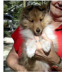
10 weeks old