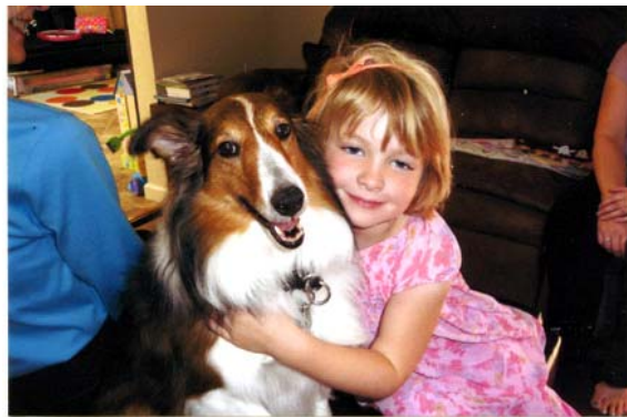
Piper & Friend