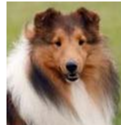
All grown up