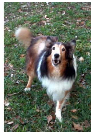
healed & happy