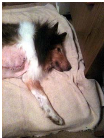
day after surgery