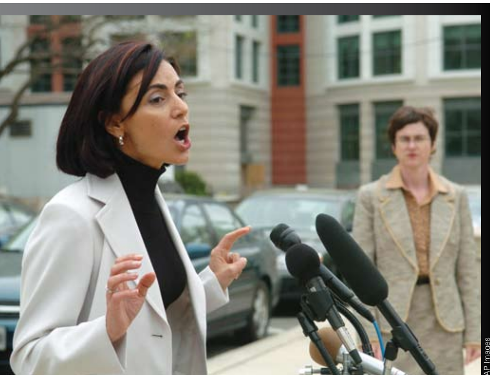
Still sounding the alarm: Former FBI translator Sibel Edmonds is shown at a 2005 press conference on her whistle-blower court case.

Seven years after 9/11, top Republicans and Democrats continue to block FBI whistleblower Sibel Edmonds' revelations of high-level spies in the federal government.