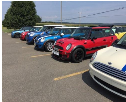
August Run to Mecca