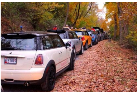
October Howl at the Moon Run