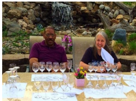
May Wine & Dine Mystery tour