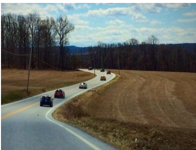
April Fool's Errand Run