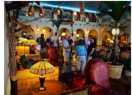
June Hershey Hill Climb