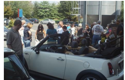
September CM/Swedish Motors Covered Bridge Tour/ Rallye