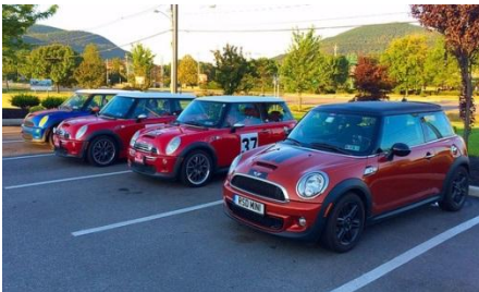
July Minis at Lime Rock Park