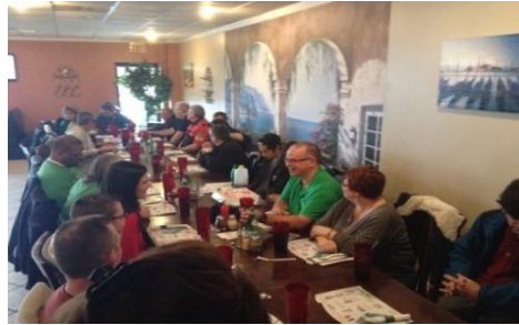
March Pi Day 3.141592