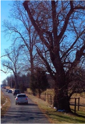
January Cabin Fever Run